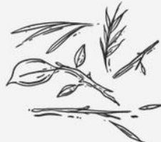
Hedge and garden clippings