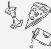
Any food or liquids