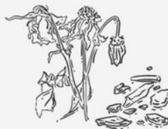
Dead flowers, house plants, leaves and bark