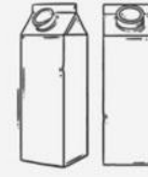
Tetra Pak i.e. juice cartons and drink cartons