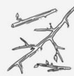
Twigs and small branches