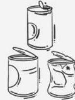
Steel/ aluminium cans and tins