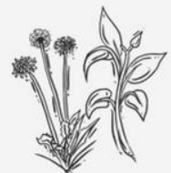
Weeds and plants