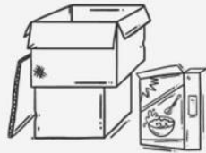
Cardboard boxes and packaging - please flatten