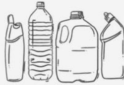
Plastic bottles - juice, water and milk bottles, shampoo and household cleaner bottles