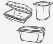
Yoghurt, margarine tubs & plastic food containers