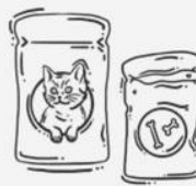
Pet food pouches