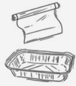
Foil trays and tin foil