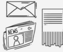
Newspapers, magazines, envelopes, shredded paper & junk mail